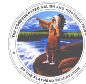
CONFEDERATED SALISH & KOOTENAI TRIBES