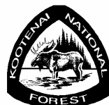
KOOTENAI NATIONAL FOREST