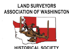
LAND SURVEYORS ASSOCIATION OF WASHINGTON HISTORICAL SOCIETY