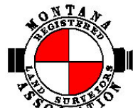
MONTANA ASSOCIATION OF REGISTERED LAND SURVEYORS