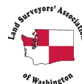
LAND SURVEYORS ASSOCIATION OF WASHINGTON