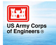
U.S. ARMY CORPS OF ENGINEERS LIBBY DAM