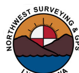
NORTHWEST SURVEYING & GPS