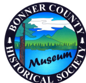
BONNER COUNTY HISTORICAL SOCIETY & MUSEUM