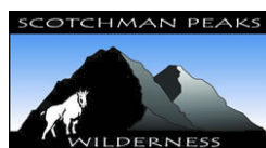
FRIENDS OF SCOTCHMAN PEAKS WILDERNESS