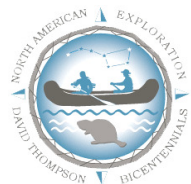
DAVID THOMPSON BICENTENNIALS